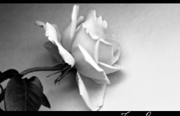
First Rose 2010