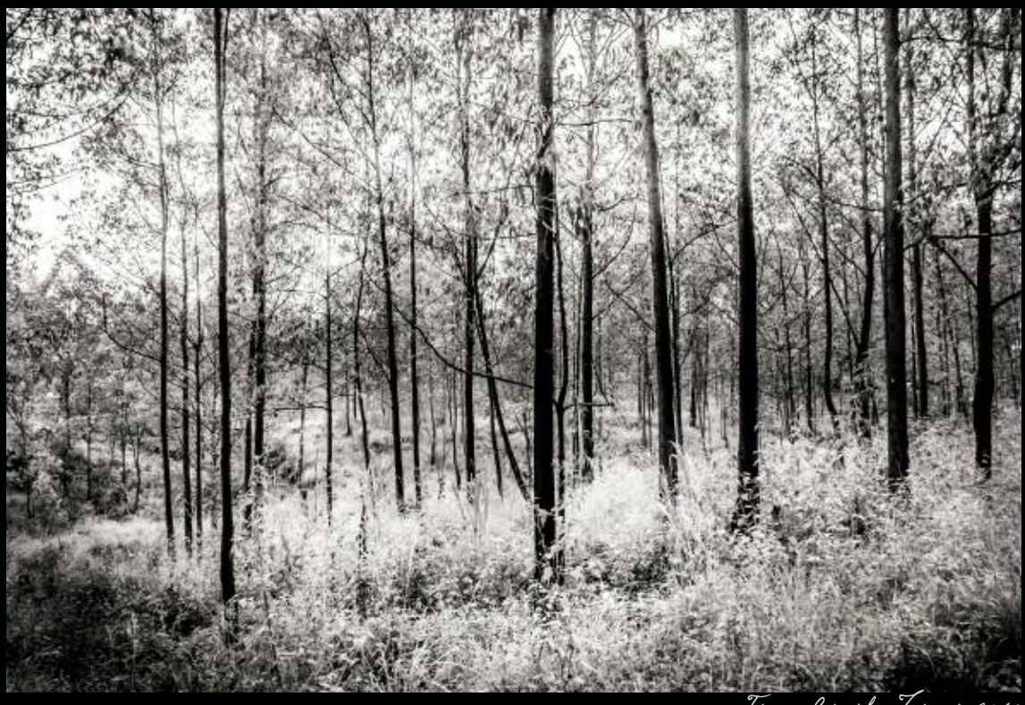
Trees for the Forest 2016