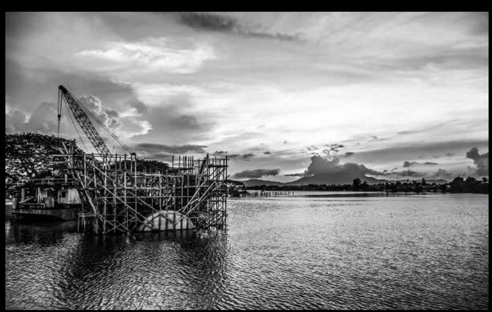
Building Blocks 2016