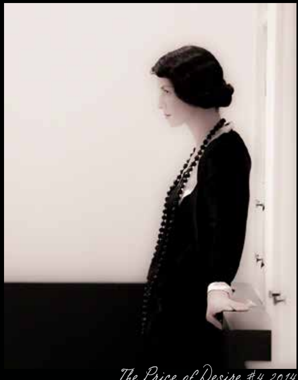
The Price of Desire #4 2014