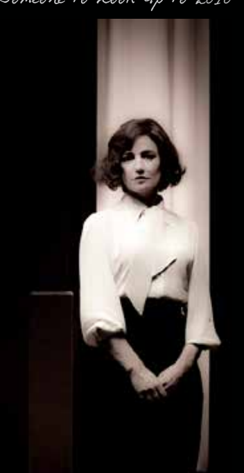
The Price of Desire #14 2014