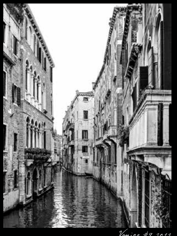
Venice #9 2013