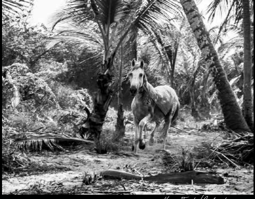
Kogi Tribe/Colombia 2014