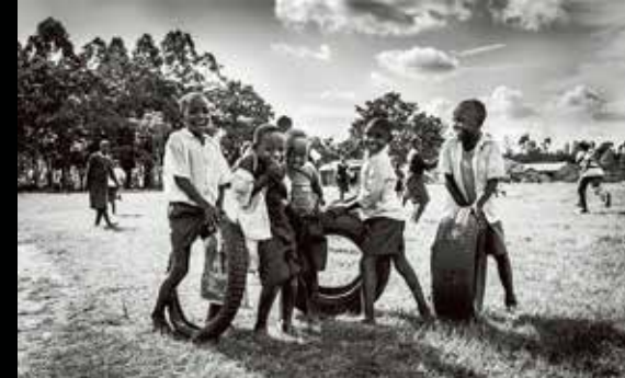
Wheels of Fortune 2014