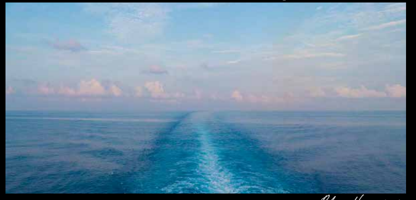
Blue You 2016