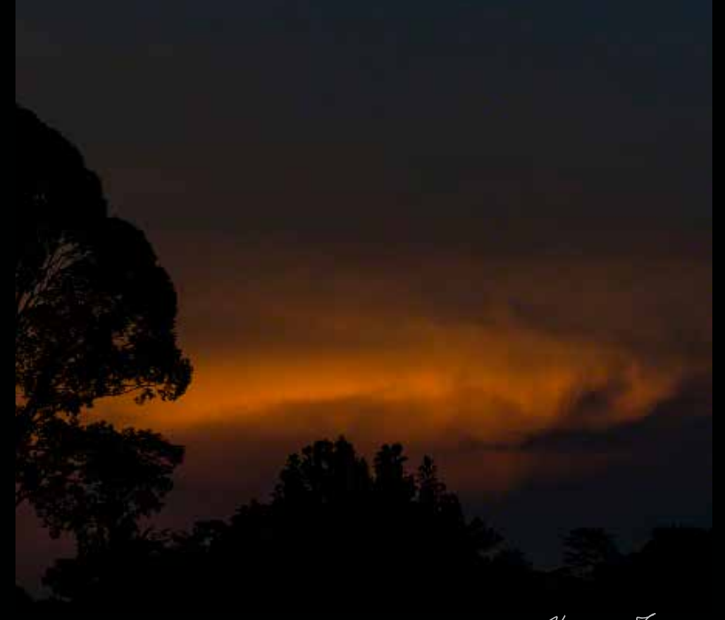
Heart on Fire 2016