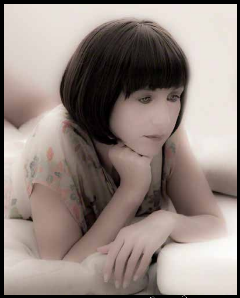
The Price of Desire #9 2014