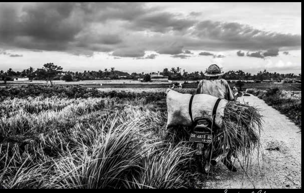
Seeds of Change 2016