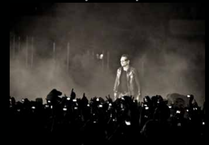
Someone We all know... 2010