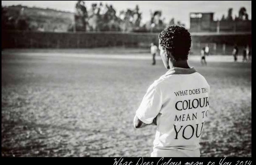
What Does Colour mean to you 2014