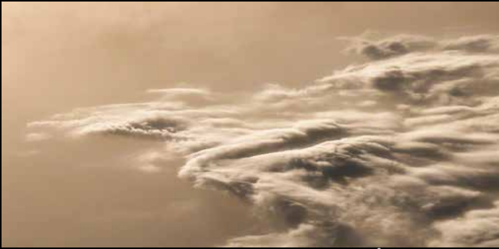
Silver Linings 2012