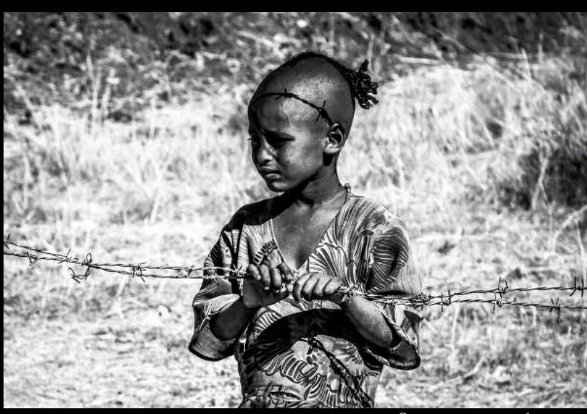
Down To The Wire 2014

HORIZON is currently represented by Emmanuel Fremin Gallery NYC