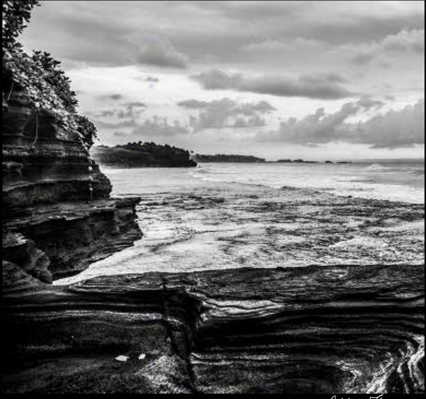
Ebb & Flow 2016