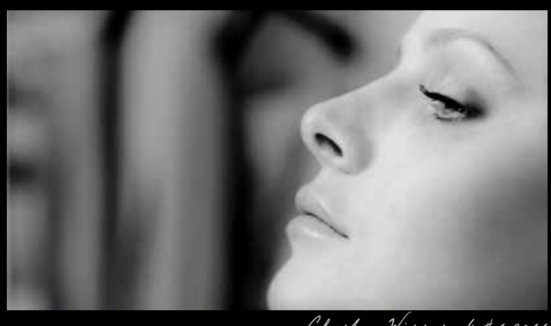
Charlene Wittstock #1 2011