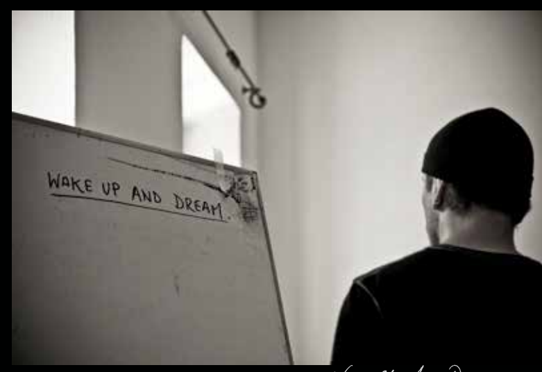
Wake Up And Dream 2010