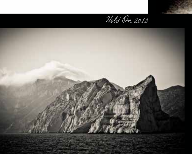
Colongués # 5 2013