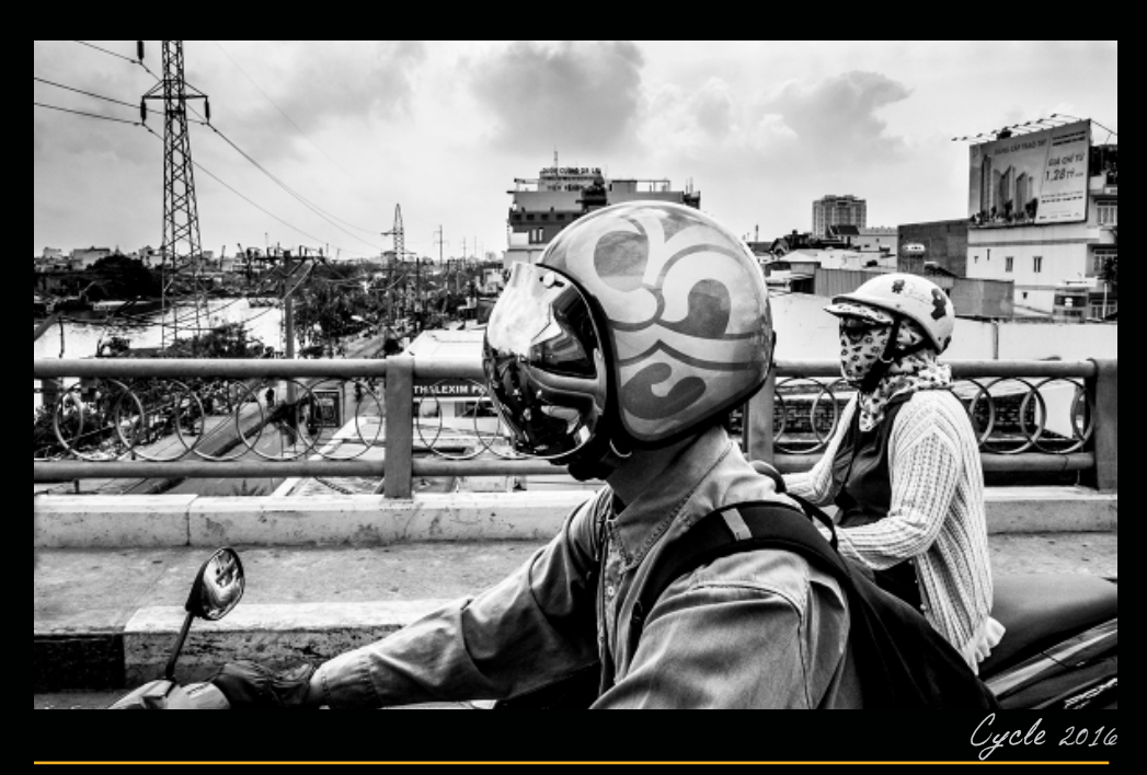
Leica Gallery Los Angeles presented Julian's latest collection, CYCLE, in September 2016. "A glimpse through the picture window, into the Cycle of Life, of those living on the borders of the South China Sea."