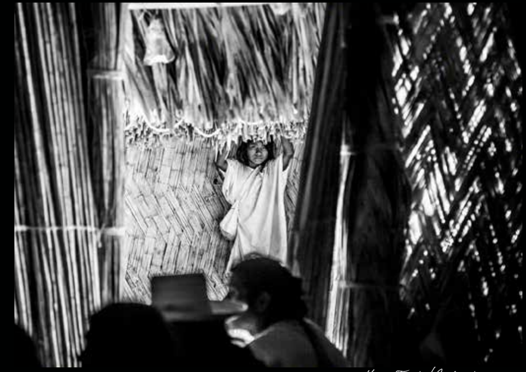
Kogi Tribe/Colombis 2014