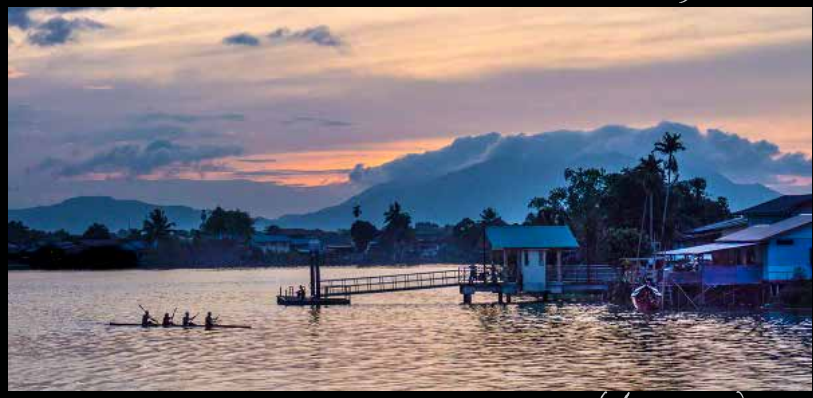
Kuching (April 8th) 2016